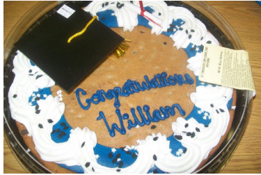
The "Graduation Cookie"